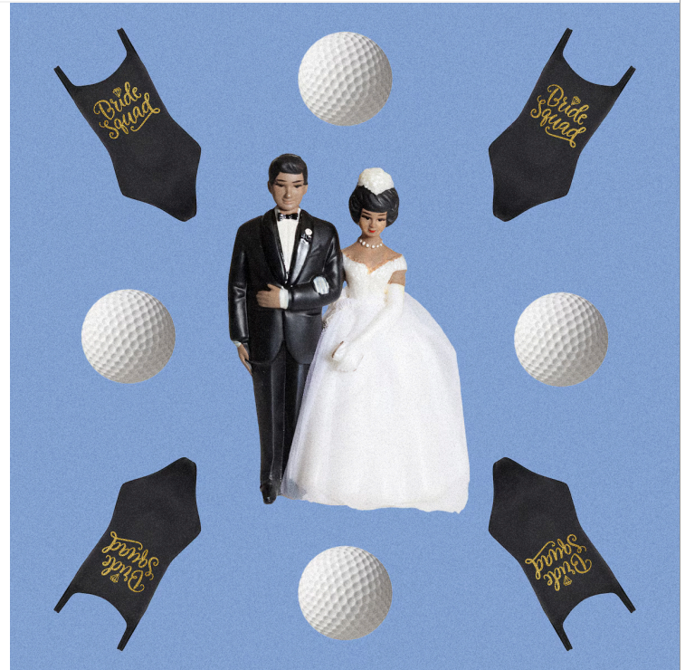
(Washington Post illustration; iStock)